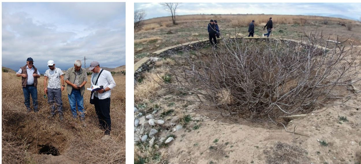
Photo taken in the field during the research work.