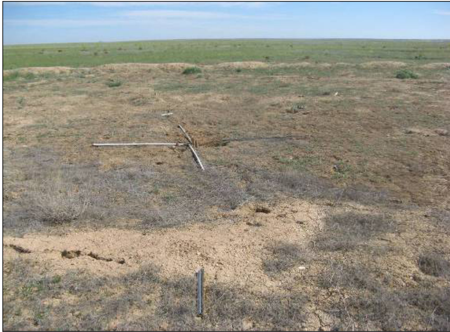
Figure 1 – General view of the crash site of the «Briz-M» upper part and part of the spacecraft transitional compartment

The crash site of the LV «Proton-M» 2013 in the Kyzylorda region in the summer of 2018 was a more or less flattened surface with the presence of furrows, which was the result of plowing during the remediation in autumn 2017, gradually rising to the south of the CS.