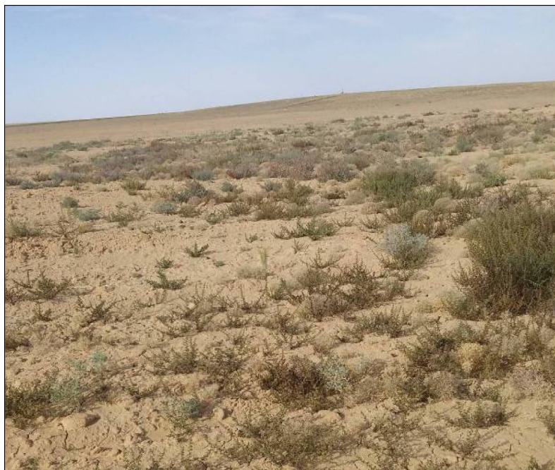
Figure 2 – Place of emergency fall of the «Proton-M» LV 2013 in September 2018